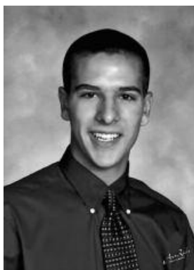
CSCA Player of the Year